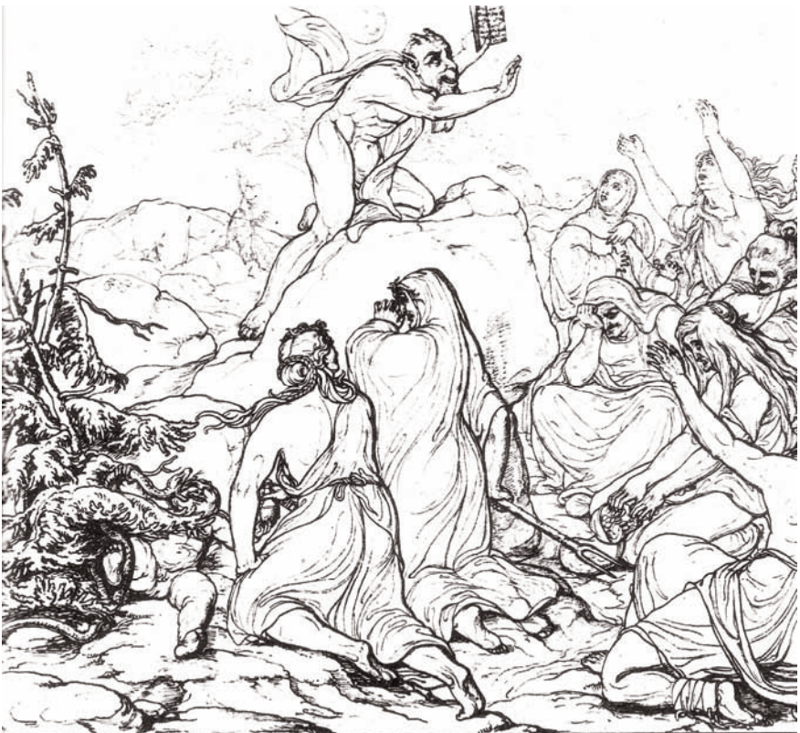
The Devil preaches to witches on the night of Mayday: a 19th Century German drawing.

Some of the most bizarre material dealing with women's sexuality comes from the Malleus Malificarum , which includes passages such as: ' And what then is to be thought of those witches who collect male organs in great numbers together, and put them in a bird's nest, or shut them up in a box where they more themselves like living members and eat oats and corn